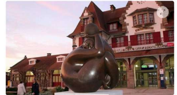
La sculpture restera devant la gare.