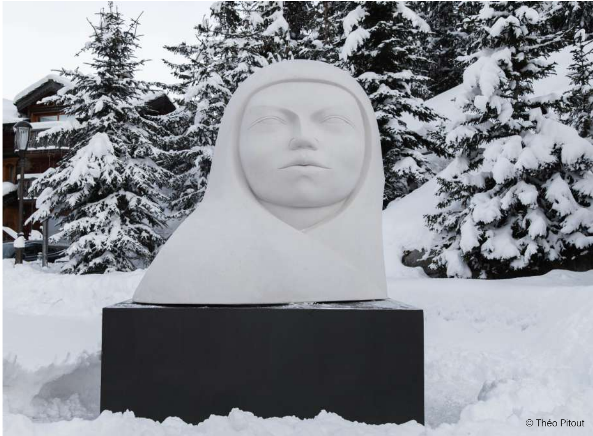
« INTENSIDAD »