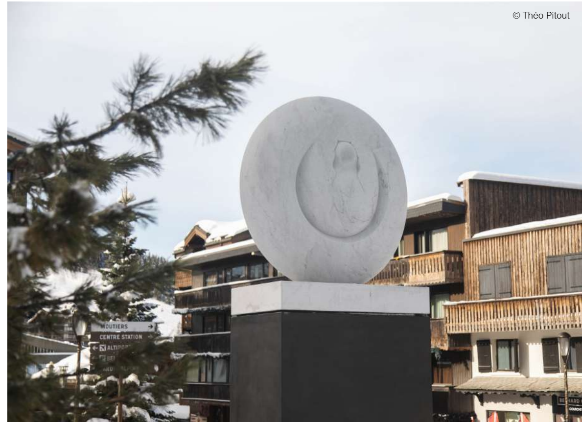
« MISTERIO »