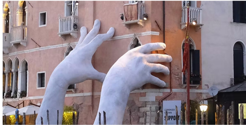
La sculpture « Support » de Lorenzo Quinn à Venise, le 19 mai 2017. L'œuvre, avec deux mains tenant l'hôtel Ca' Sagredo a fait partie de la 57e Exposition internationale d'art de la Biennale de Venise, et vise à mettre en évidence le changement climatique (détail).