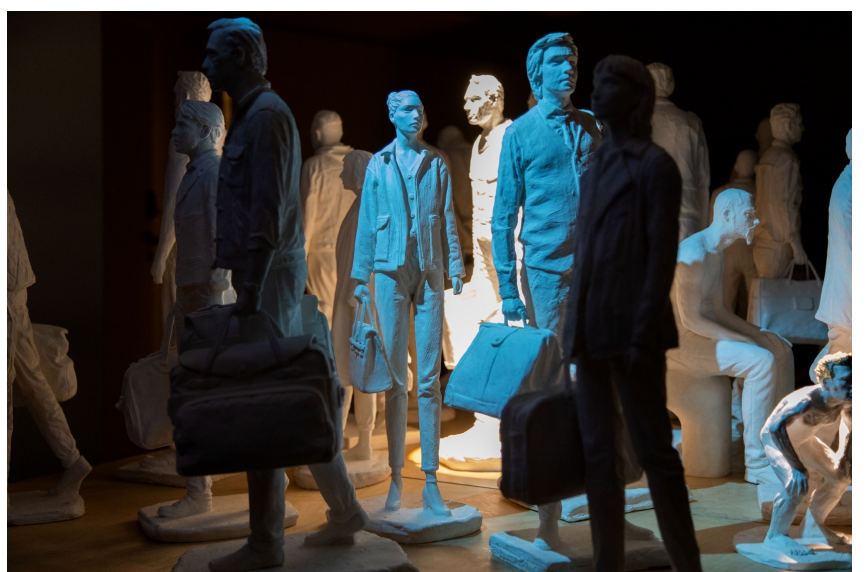
THE PLASTER ROOM