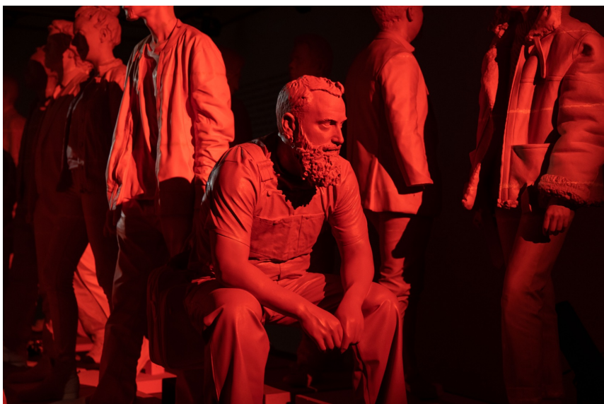
THE SCAN ROOM