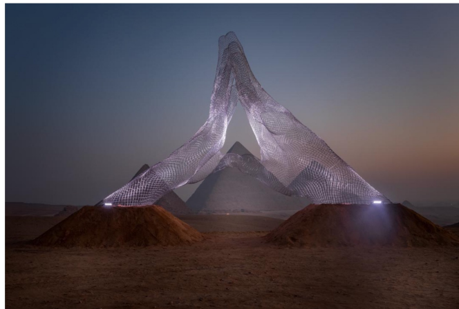
'Together' by Lorenzo Quinn.

The 'Forever is Now' exhibition features monumental artworks