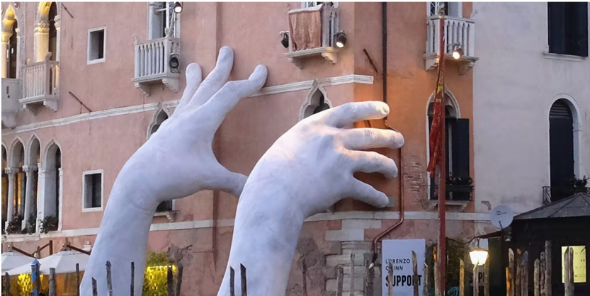
La sculpture « Support » de Lorenzo Quinn à Venise, le 19 mai 2017. L'œuvre, avec deux mains tenant l'hôtel Ca' Sagredo a fait partie de la 57e Exposition internationale d'art de la Biennale de Venise, et vise à mettre en évidence le changement climatique (détail).